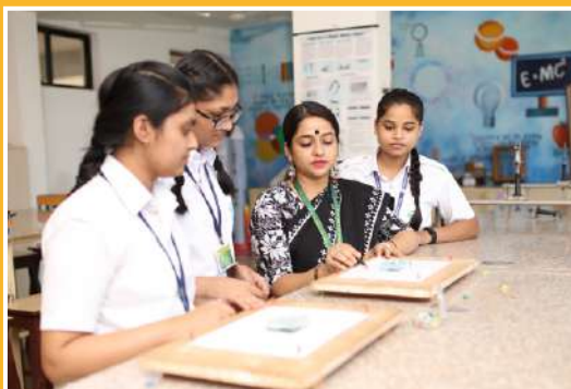
Activity in Physics Labs