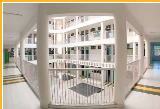
Spacious & Airy School Building