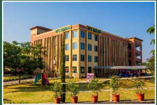
DPS MIHAN, Nagpur