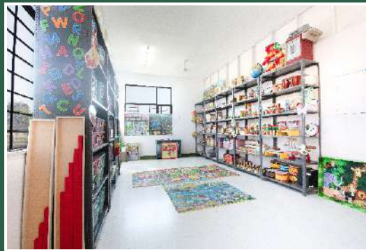
Well Stocked Resource Center