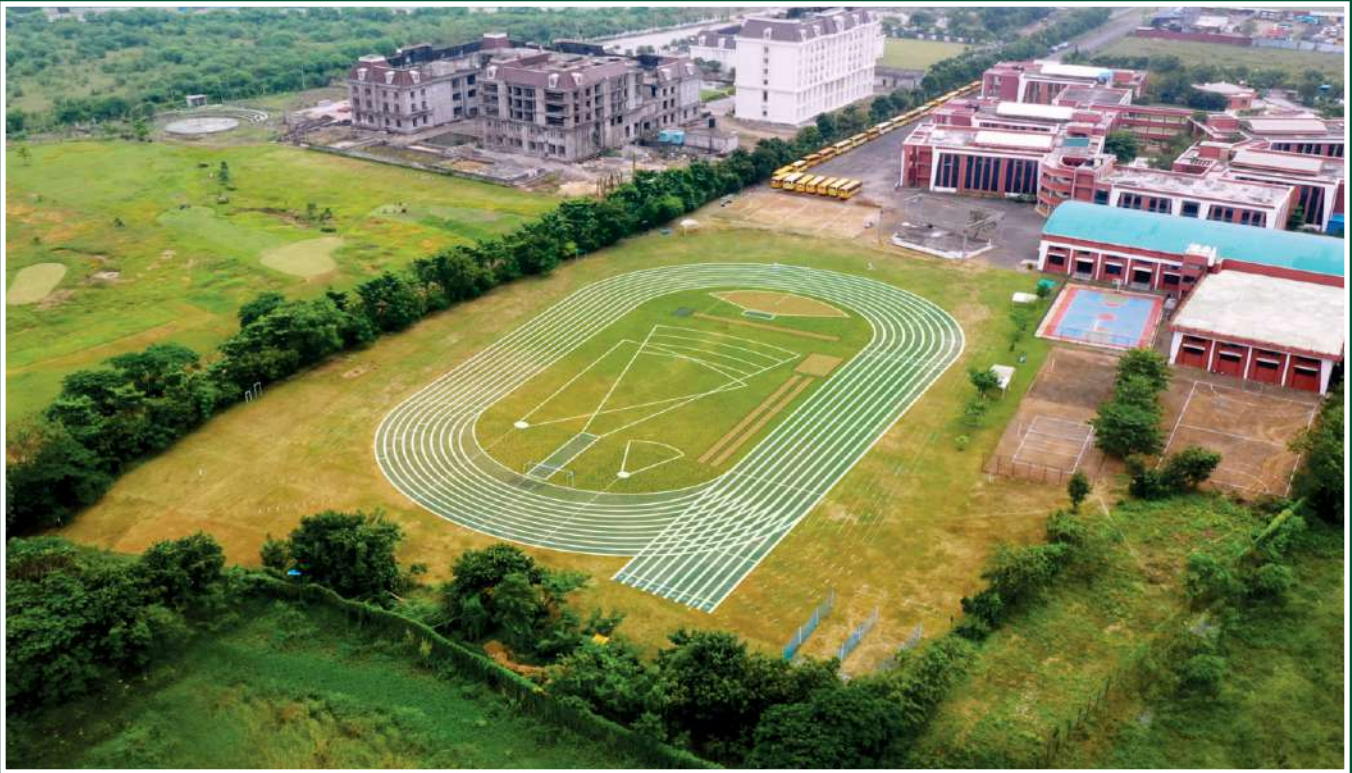
DPS KAMPTEE ROAD, NAGPUR