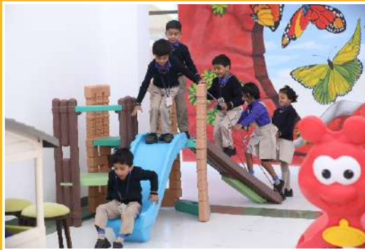
Indoor Play Area