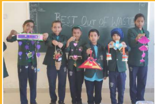
Best Out of Waste