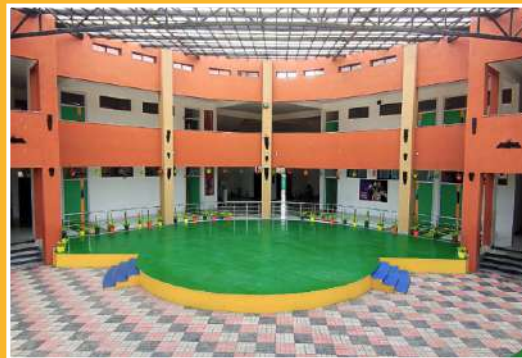
DPS MIHAN, Artist Village