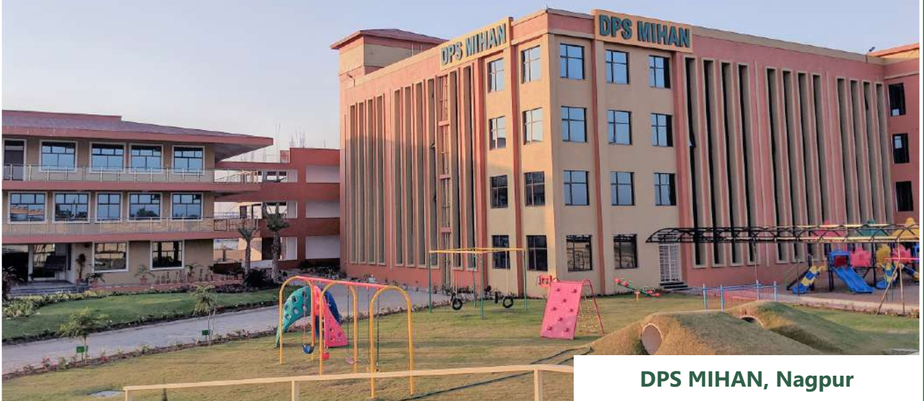
DPS MIHAN, Nagpur

A lush green, naturalistic, peaceful and protected land sprawling across 15 acres at the Kamptee Road campus and 12 acres at the MIHAN campus stands as the backbone of the schools. Moreover, the state-of-art infrastructure having well-ventilated classrooms, ergonomically designed furniture, well-stocked libraries, experiential learning studios and inspiring recreational facilities with seamless technology integration in a conducive environment adds more value to the heritage.