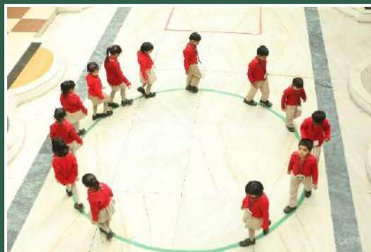
Fun & Learn at every step