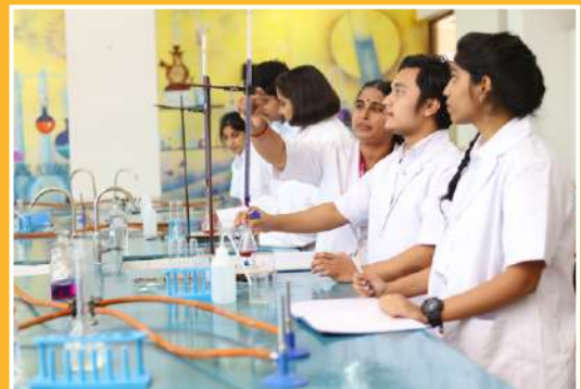
Well Equipped Labs