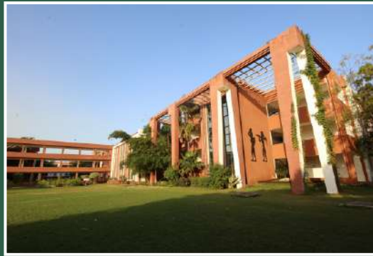
DPS Kamptee Road, Nagpur