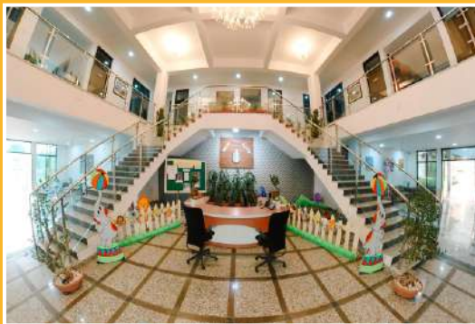
DPS MIHAN, Reception Area