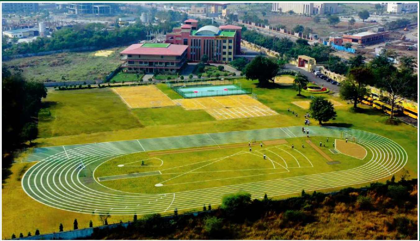
DPS MIHAN, NAGPUR