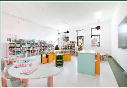
Well Stocked Junior Library