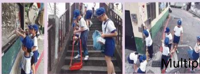
▲ 服務體驗 community service