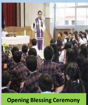
Opening Blessing Ceremony