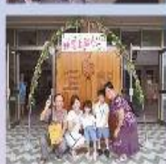
▲ 迎新 Orientation