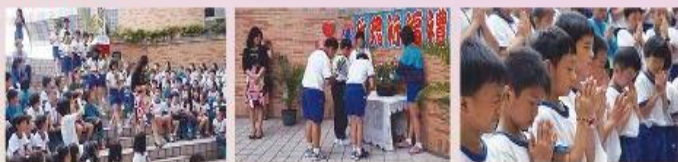
▲ 玫瑰祈福禮 Rose blessing ceremony