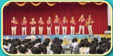
● 英語嘉年華會 the English Studio Classroom Carnival