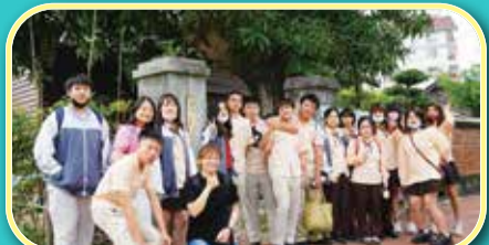
● 朴子故事館 Puzi Story House