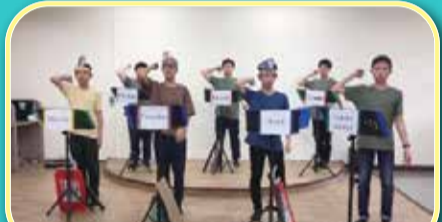
● 109學年嘉義市英語讀者劇場特優及優良劇本獎 2021 English Reader's Theater